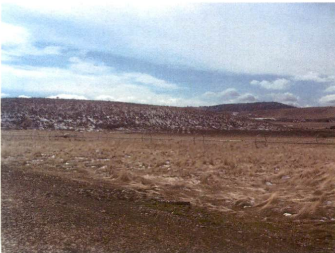
Actual Item to be Surplussed