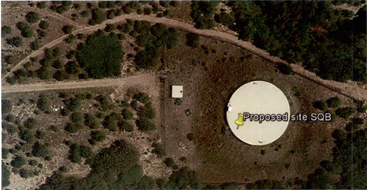
Exhibit "B" Site Sketch

Site B located at: 39.9748556, -111.7583083